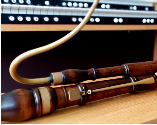
TARSUS / ADANA - TÜRKİYE